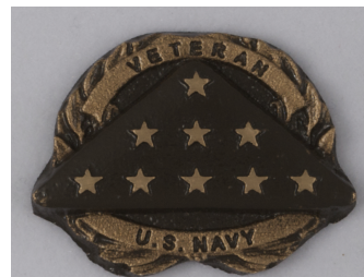
One-and-one-half inch Medallion