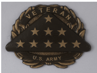
Three inch Medallion